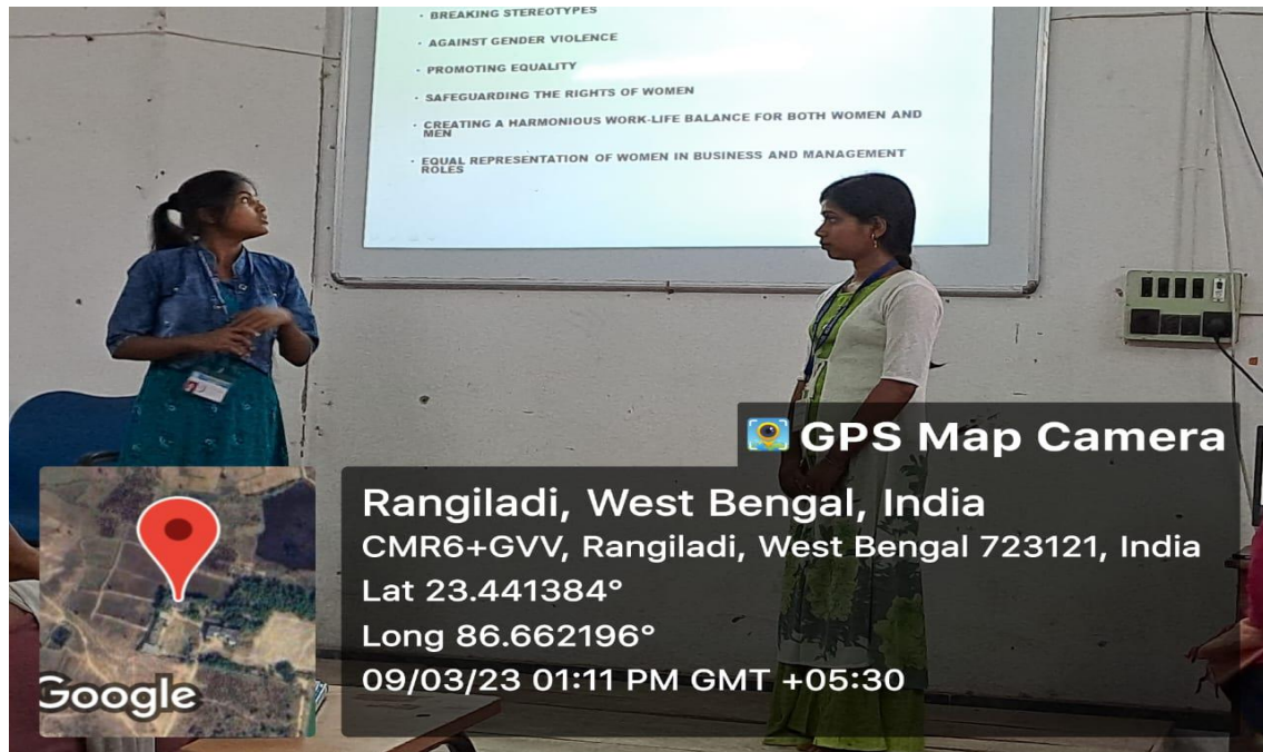
Students presenting their PowerPoint on Celebrating Womanhood and their inspiring stories