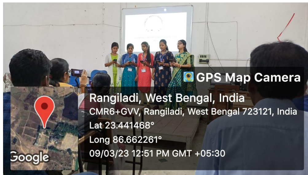
Group Song by the students