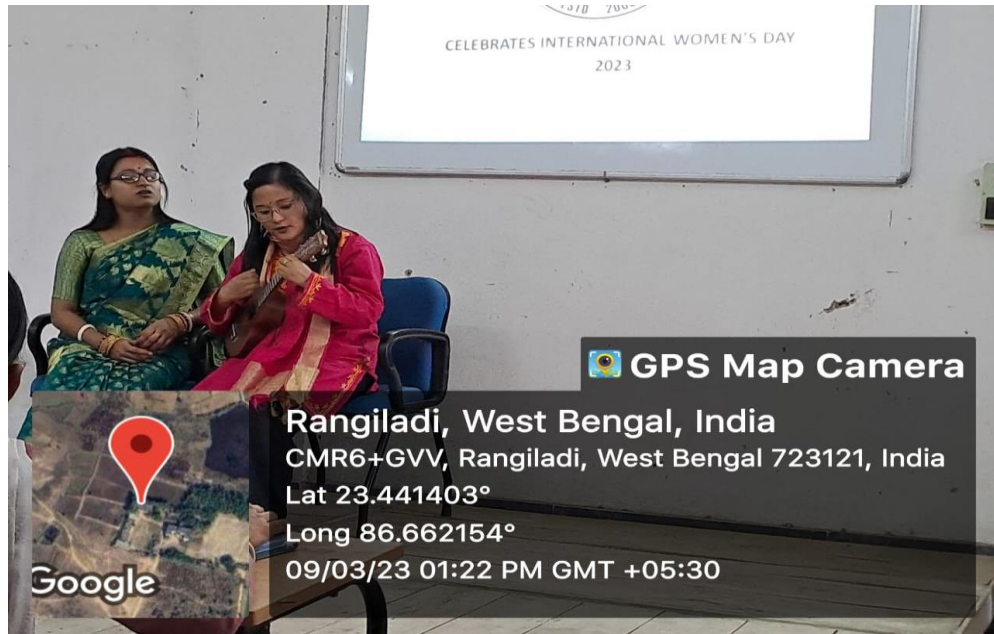
Performance by the teachers